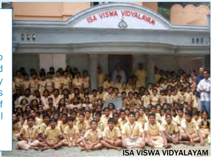
ISA VISWA VIDYALAYAM

To contribute to building a world where every human being is capable of achieving Total Consciousness.