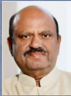
Inauguration: His Excellency the Governor of West Bengal